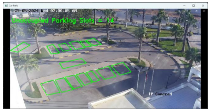
Figure 4 Parking slot selection

After defining the parking slot coordinates, OpenCV was utilized to load the video frames captured from the parking area. For each frame, polygons representing individual parking slots were drawn using the predefined coordinates. Specifically, OpenCV's cv2.polylines() function was employed to overlay the boundaries of each parking slot on the frames, providing a clear visual segmentation of the parking areas. The annotated frames were displayed in real-time using cv2.imshow().