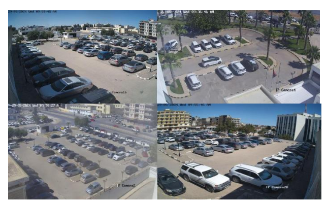
Figure 1 Photos of the obtained surveillance footage

After preprocessing, the system employs a YOLO to detect and locate vehicles within each video frame. The model analyzes each frame to identify vehicle positions and labels them accordingly.