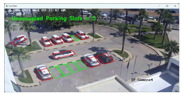
Figure 6 Detection Results in a 14-space parking

These findings confirm the robustness and effectiveness of using a pre-trained YOLO model combined with OpenCV-based image processing for parking occupancy detection, outperforming traditional manual and sensor-based methods in both efficiency and accuracy.