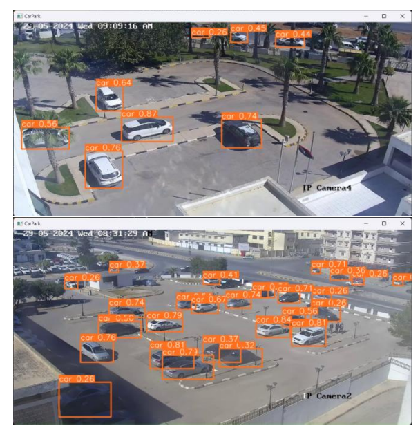
Figure 5 model inference result on custom data

YOLO Model Training: We are using the pre-trained YOLOv8 , a state-of-the-art deep learning model for car detection without additional training for real-time car parking detection systems.