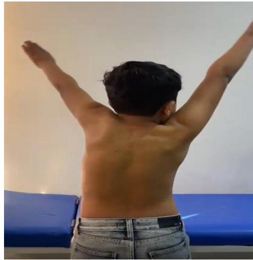
Figure 5. Three-year follow-up clinical photograph demonstrating sustained correction of scapular position with symmetrical shoulder alignment and full range of motion.

At 3-year follow-up (current age: 11 years), these improvements were maintained, with sustained full shoulder range of motion and continued cosmetic satisfaction (Figure 6). Functionally, the patient and his family reported significant improvement, including resolution of previous limitations and absence of exertional shortness of breath.