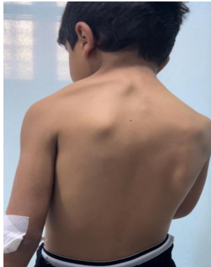
Figure 1. Preoperative clinical photograph demonstrating marked elevation of the left scapula with shoulder asymmetry consistent with severe Sprengel's deformity (Cavendish grade IV).

The deformity was associated with significant restriction of shoulder abduction, limited to approximately 50 degrees preoperatively (Figures 1 and 2).