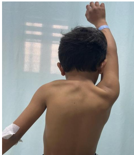
Figure 2. Preoperative clinical assessment showed restricted shoulder abduction on the affected side, limited to approximately 50 degrees.

No neurological deficits were identified, and motor and sensory examinations of the affected upper limb were normal. Computed tomography (CT) and magnetic resonance imaging (MRI) were obtained for detailed evaluation. CT imaging demonstrated an ossified omovertebral bar extending from the superomedial border of the scapula toward the cervical spine. The omovertebral connection was fully ossified. Notably, the medial end of the omovertebral bar extended into the spinal canal at the C4–C5 level, corresponding to Rigault type II (Figure 3). MRI revealed a normal-appearing cervical spinal cord at this level, with no evidence of intramedullary signal abnormality.