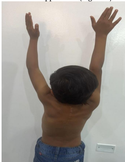
Figure 4. Six-week postoperative clinical photograph demonstrating improved scapular position, restoration of shoulder symmetry, and marked improvement in shoulder abduction.

An extraperiosteal dissection of the superomedial scapular border was performed, followed by partial resection of the prominent segment. The scapula was then gently everted and mobilized inferiorly. The latissimus dorsi muscle was elevated to allow passage and repositioning of the scapula beneath it. Inferior traction was applied to the rhomboid and trapezius muscles, allowing controlled scapular descent to the desired level. The scapular spine was positioned at the level of the contralateral side. Reconstruction of the muscular envelope was then performed. The rhomboid and trapezius muscles were reattached to the spinous processes at a more caudal level. Finally, the latissimus dorsi muscle was reattached to the scapular tip, and layered wound closure was performed. At 6 weeks postoperatively, the patient demonstrated full shoulder range of motion with marked cosmetic improvement. Muscle strength was graded 5/5, and no sensory deficits were identified in the affected upper limb (Figure 4).